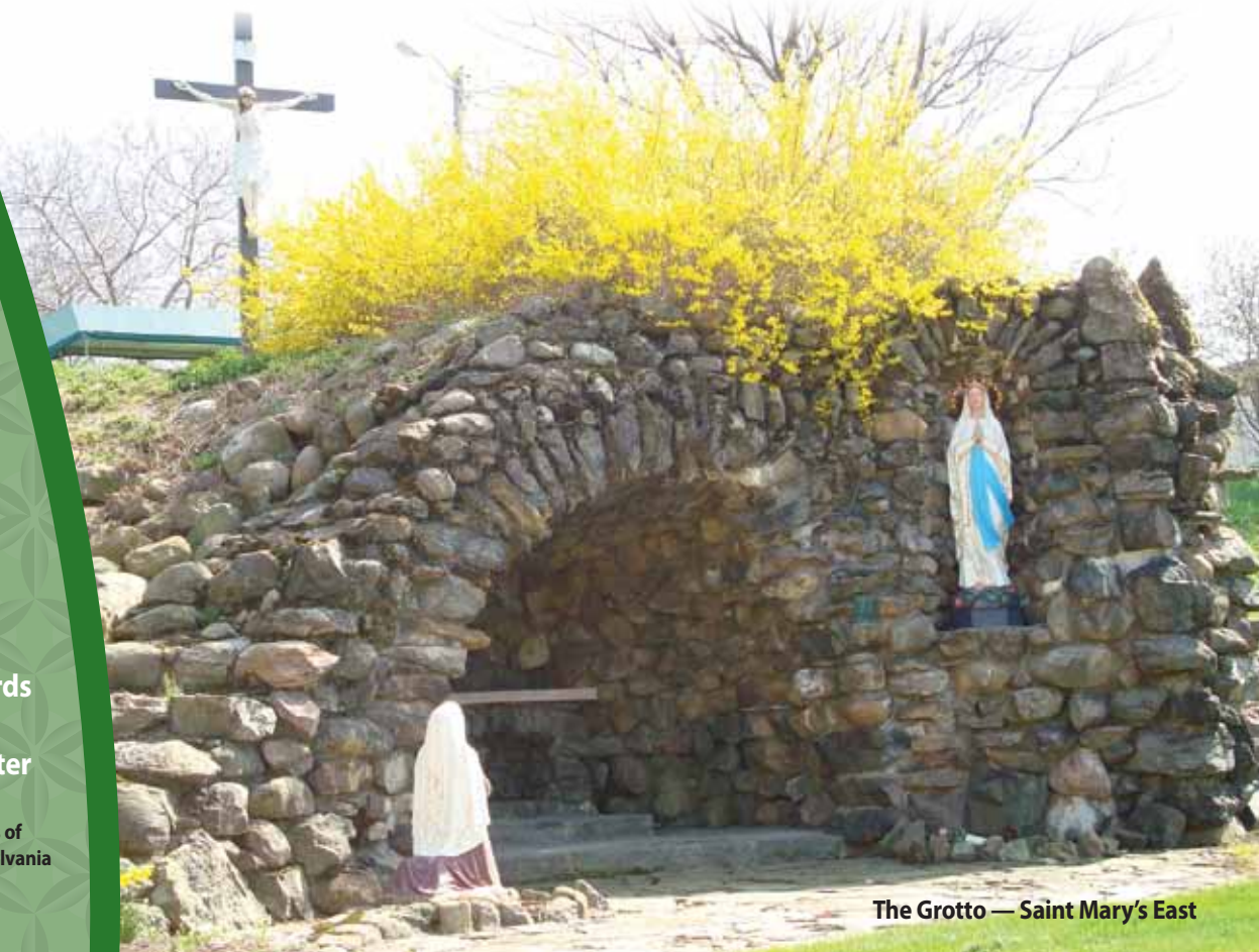
The Grotto — Saint Mary's East

A sponsored ministry of the Sisters of St. Joseph of Northwestern Pennsylvania