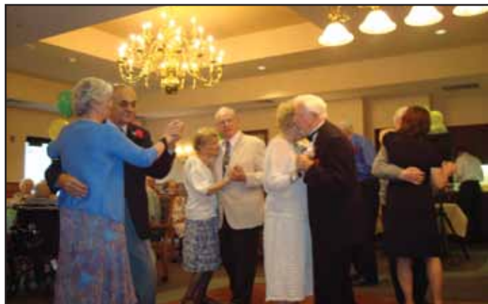
The Residents of the Carriage Homes and Asbury Ridge Residential Living enjoyed an evening of music, dancing, food, and entertainment at the 2009 Senior Prom.

At Saint Mary's East the beginning of June marked the beginning of what appears to be the start of a new annual event, The Spring Fashion Show. This was an intergenerational event that brightened the lives of anyone who was fortunate enough to attend it. Saint Mary's East Employees (many high school students) and their friends wore tuxedos, prom dresses, and beautiful Spring clothing as they walked a runway in front of a packed room of Residents and Family Members. After the first set of Employees walked the runway, they would then each take a turn walking the runway again, but this time with a Saint Mary's Resident. A number of Residents at Saint Mary's wore their best outfits as they modeled them on the runway with their younger counterpart.