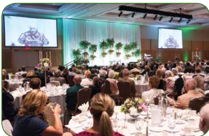
Saint Mary's Follies 2016