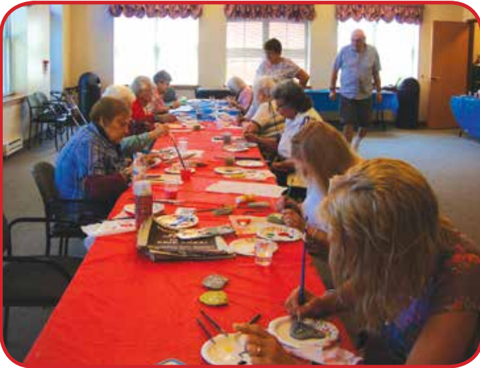
A group of Residents at Saint Mary's at Asbury Ridge spending an afternoon painting together.

Saint Mary's joined the "Rock Out Erie!" movement this Summer helping to spread joy and appreciation for art through painted rocks. Residents at both Saint Mary's East and Saint Mary's at Asbury Ridge had fun getting creative with their inner artist during this community project. Students from Mercyhurst University joined the project at Saint Mary's East and enjoyed mixing and mingling with the Residents. A group of Saint Mary's East Residents later took a surprise trip over to Saint Mary's at Asbury Ridge, placing their decorated rocks around campus to bring joy to the west-side Residents.