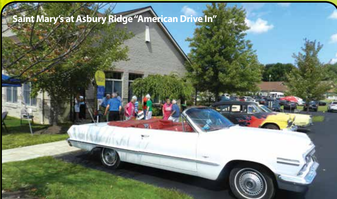
Saint Mary's at Asbury Ridge "American Drive In"

A Publication of Saint Mary's Home of Erie