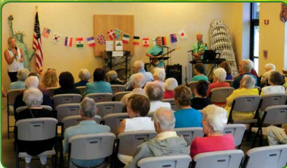
An Evening of Entertainment and Food with an International Flair Saint Mary's at Asbury Ridge