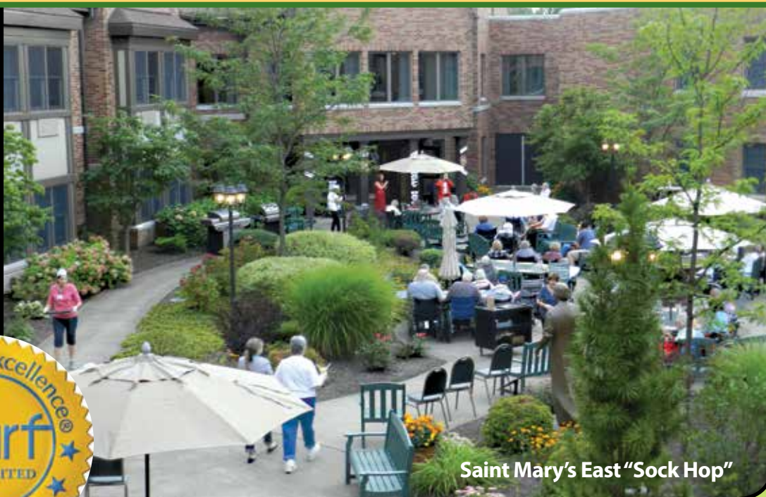
Saint Mary's East "Sock Hop"