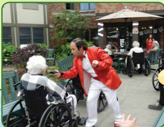
Happy Days performing at the Sock Hop Saint Mary's East

The Activity and Dietary Departments at Saint Mary's East planned a "Sock Hop" that was highlighted by an entertaining concert from the group, Happy Days. Residents and guests enjoyed this 1950s themed event in one of the beautiful courtyards at the East Campus. Employees and Volunteers dressed for the occasion and served ice cream sodas throughout the concert.