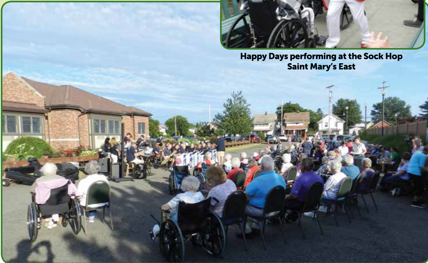
Mayor's Sounds of Summer Music Series – Saint Mary's East