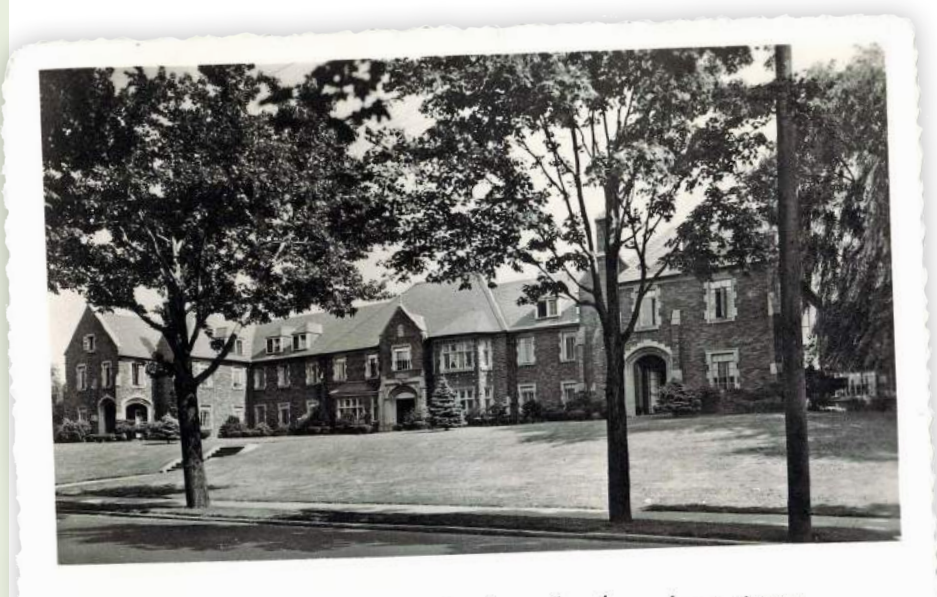
To thank you as we'd like to do is far beyond our power. For if we had no friends like you there'd be no home like ours.

Postcard pulled from the archives at Saint Mary's. Our sentiments remain the same.