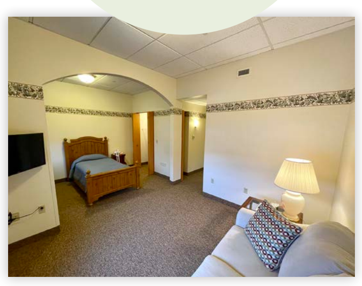
{\it Existing studio layout before the renovation into a larger senior living option.}