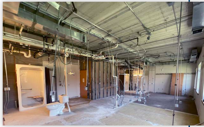
The first phase of renovation to the existing units involved demolition of interior walls to expand the footprint of the floor plan.

These enhancements will help Saint Mary's continue to meet the needs of seniors who desire and independent lifestyle while having the support and peace of mind that comes from being part of a retirement community.